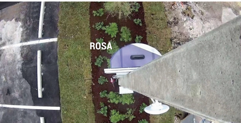
Top-down view of ROSA at one of the construction company's projects in Florida